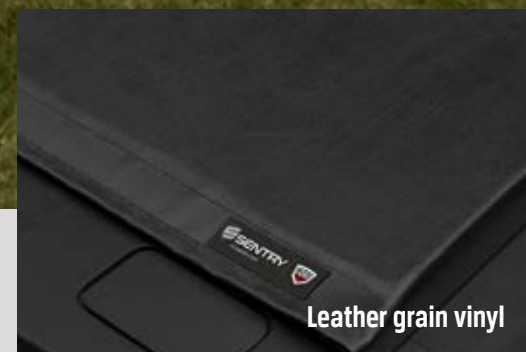
Leather grain vinyl