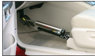
BrakeMaster™ Proportional braking system

— BrakeMaster is recommended if you don't frequently change motorhomes or towed vehicles. Because it connects directly to the motorhome's braking system, the initial installation is longer than a portable system. But once installed, it's a truly trouble-free and easy-to-use braking system.