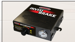
InvisiBrake® 'Set-it-and-forget-it' braking system

— InvisiBrake is recommended if you like convenience above all else and don't trade in cars every couple of years. InvisiBrake is not a portable system, but the major components can be easily removed and installed in a new towed vehicle.