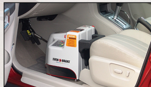
Even Brake® Portable proportional braking system