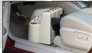
9700 Portable pre-set braking system

— Even Brake and the 9700 are recommended if you change towed vehicles or motorhomes often. Both are portable systems, with no installed components in the motorhome except for a dashboard monitor.