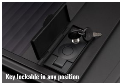
Key lockable in any position